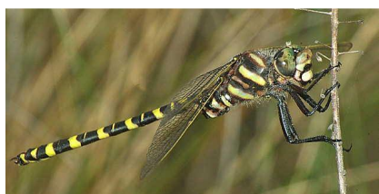
Say's spiketail, Cordulegaster sayi