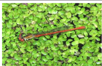
Duckweed firetail, Telebasis byersi

Martha is a native Floridian, born and raised north of Tampa on a 300+ acre cattle ranch. As an only child with no neighbors, she grew up spending a lot of time out in the