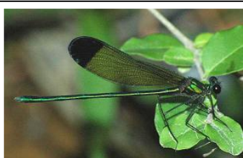
Sparkling jewelwing, Calopteryx dimidiata

newsletter editor and president; and currently, secretary again. She is also a Brevard County Master Gardener, a member of the Space Coast