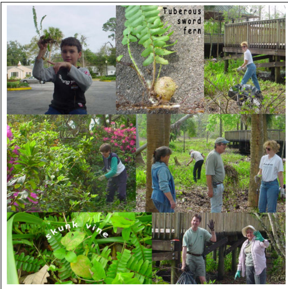
Pulling Out Exotic Invasives at Langford Park