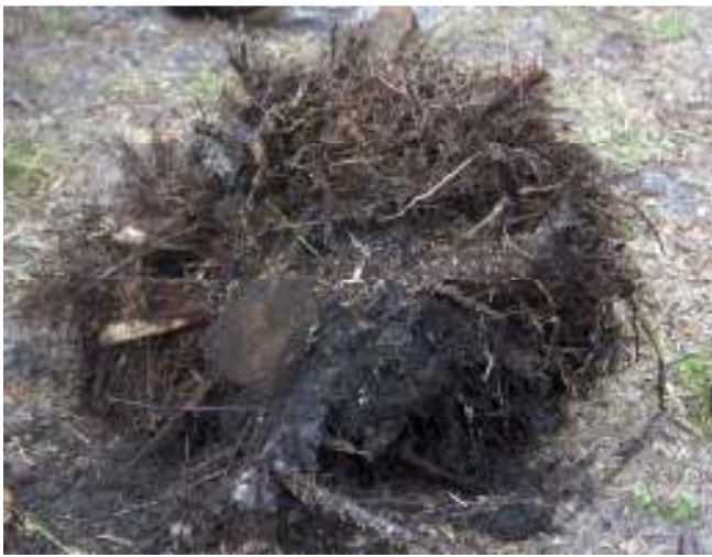
Pond Cypress Roots

lucky enough to see the endangered Prunus geniculata (scrub plum) in bloom, check it out.