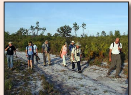
On the trail