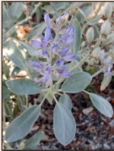
Savannah sparrow