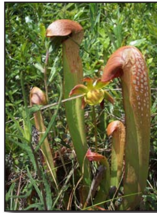
Pitcher plants

Tosohatchee Wildlife Management Area is our May destination. This is one of our premier wildflower areas