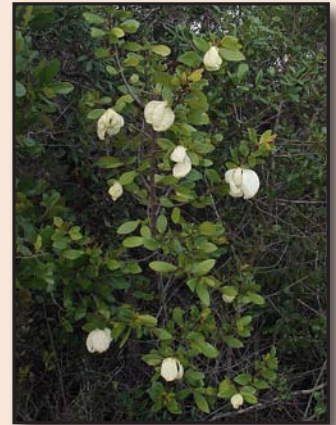
Paw paw ( Asimina obovata )