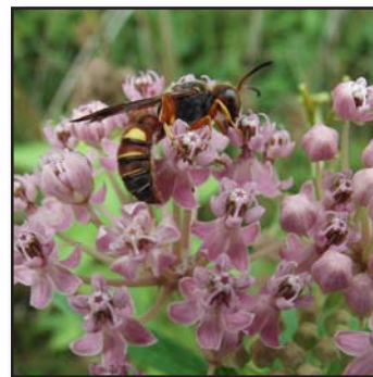
Wasp on Swamp Milkweed

where one doesn't have to venture too far off the road to get a good look. We will meet Saturday, May 14 at 9am and spend about 3 hours driving through the WMA and stopping along the way. Dress for the outdoors, bring plenty of water and a lunch. This is considered an easy trip since most of the viewing is close to the cars with no long distance walking. The entry fee is $3.00 per person or $6.00 per car. We will meet