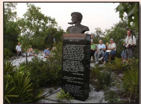
Supper by twilight