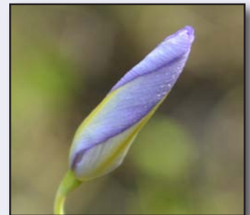
swelling Nemastylis floridana bud

A member of the Iris family, the tall narrow stems of the Nemastylis floridana or fallflowering ixia are very hard to see without a flower on top. You wouldn't know they were there until the flower bud begins to swell in the afternoon. Then between 5 and 6pm, the bud suddenly pops part way open. It opens fully about half hour later. If you had been there, you would understand why this deep blue flower is known as the celestial lily.