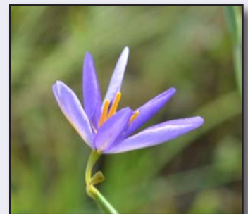
Nemastylis floridana bud opening