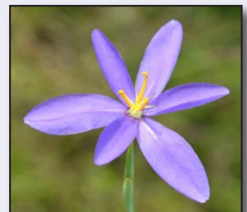
Nemastylis floridana bud fully open

As usual, there was much else to see at Tosohatchee — from buzzards and turkeys to the St. Johns River itself. Some other impressive flowers were on display including the swamp milkweed ( Asclepias incarnata ), swamp hibiscus ( Hibiscus grandiflorus ) and the queen of the swamp, scarlet rosemallow ( Hibiscus coccineus ).